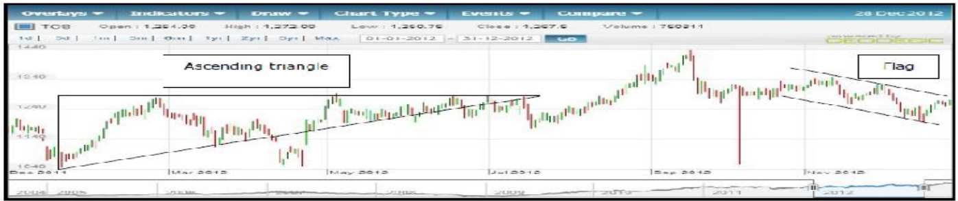
Fig. 1. Yearly chart of Tata Consultancy Services (2011–2012).